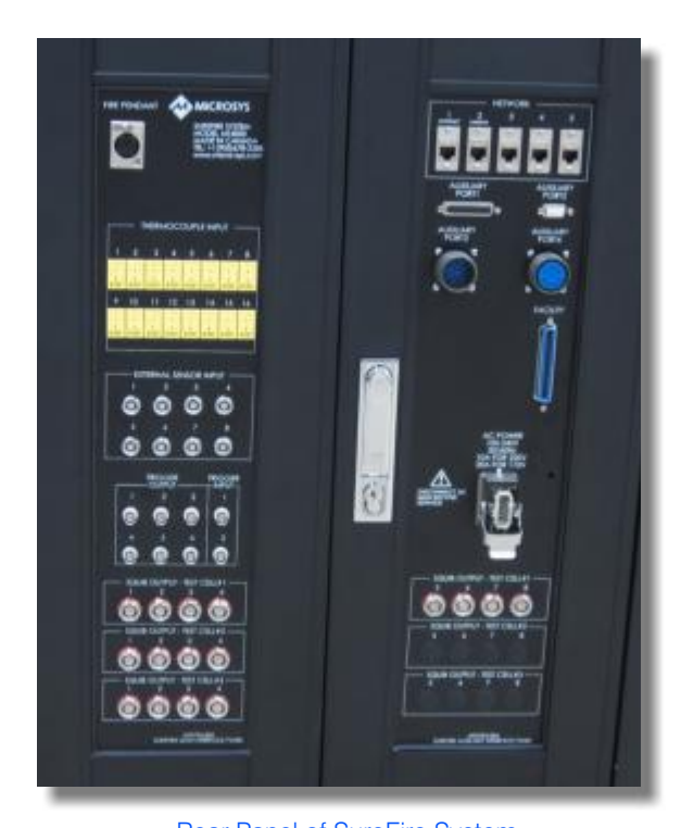
Rear Panel of SureFire System showing connections

SureFire is a fully automated system for testing airbags, inflators, instrument panels, seats, pretensioners and other pyrotechnic devices